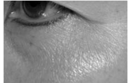
Before TIME DEFIANCE Intensive Repair Serum