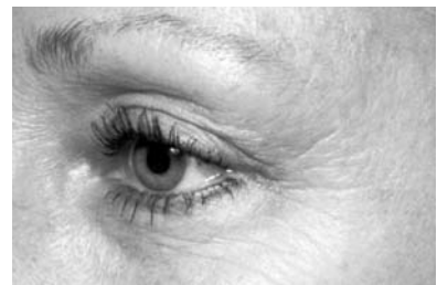
After 12 weeks using Vitamin C + Wild Yam