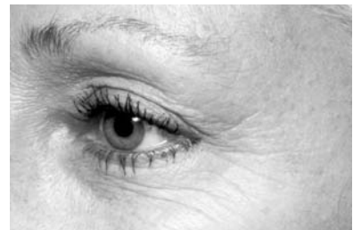
Before Vitamin C + Wild Yam